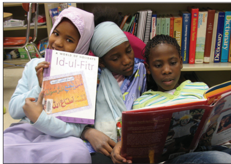
Three GECRC students share reading and friendship